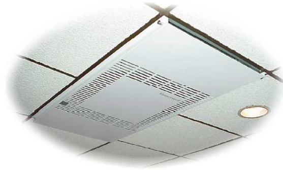
Ceiling Mount Media F-118-A