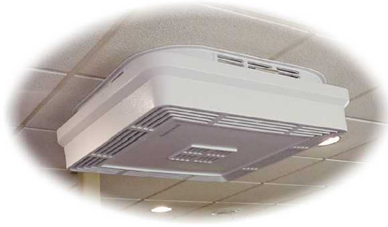
Surface Mount Media F-115C

5390 Elizabeth Lake Rd. Ste. A Waterford, MI 48327 (248) 682-3110 Fax (248) 682-3199